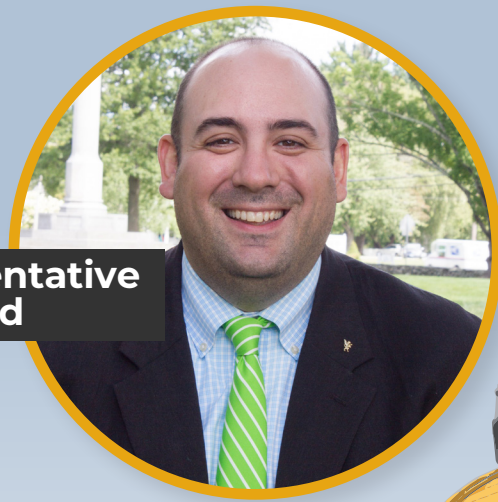
State Representative Pat Boyd